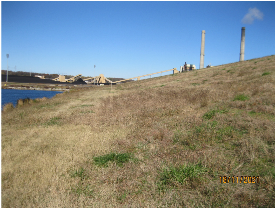
Figure 4-1 – Crest of West Embankment, South End Looking North.

The crest of the embankment on the south side of the landfill had been covered with ash and the crest was not distinguishable along the side slope. The original permitted landfill embankments to the northeast and east have been stripped of topsoil. This soil is planned to be used as cover soil on the final grades of the CCR material.