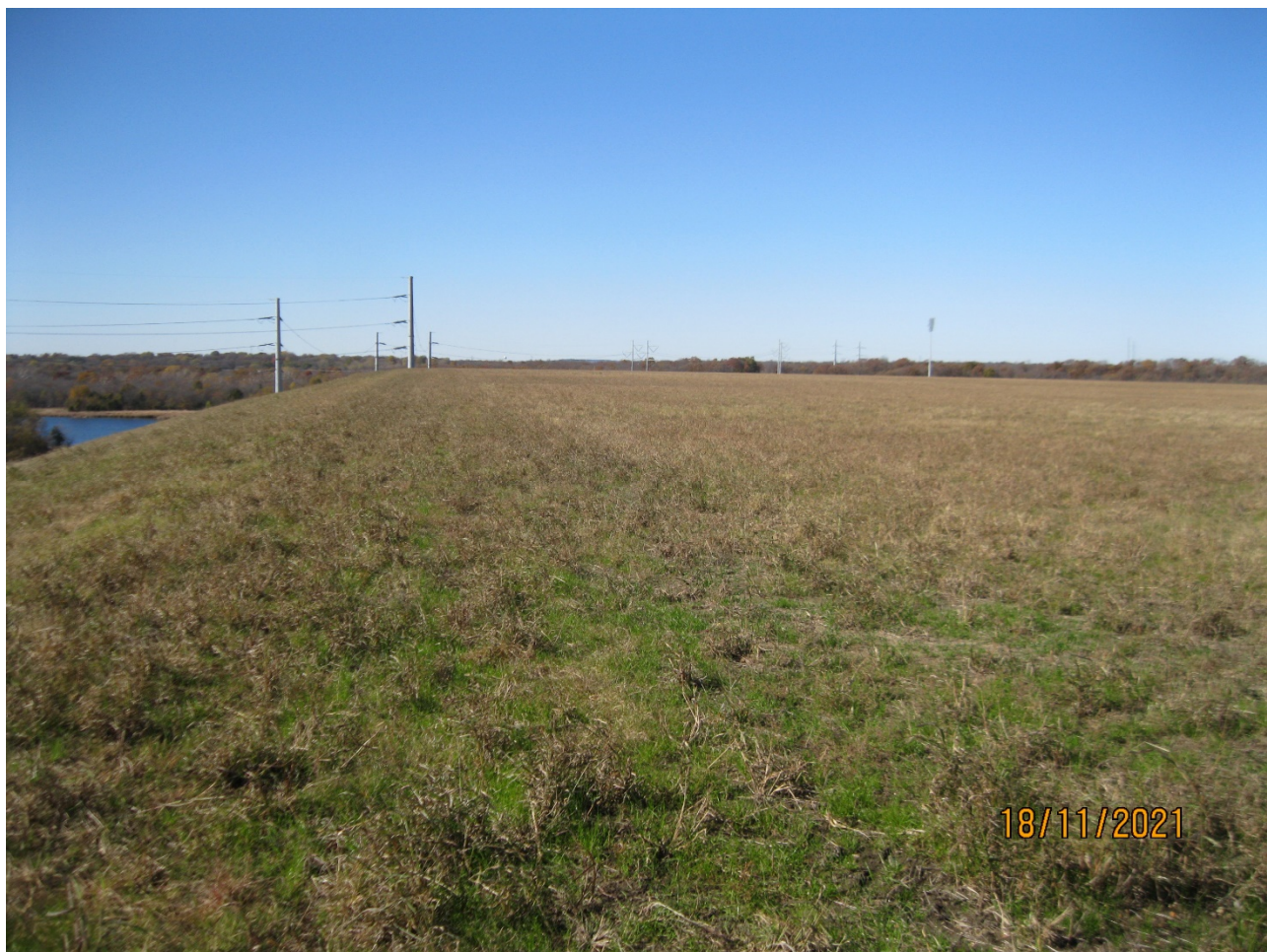
Figure 4-2 Final Cover on CCR Material – South Slope and Top. Looking West

The areas of the CCR material that have reached final grade have been capped with the planned cover soil, topsoil, and grass seed. In general, the cover soil observed on the closed portion of the landfill was the same condition as the exterior slopes of the embankment.