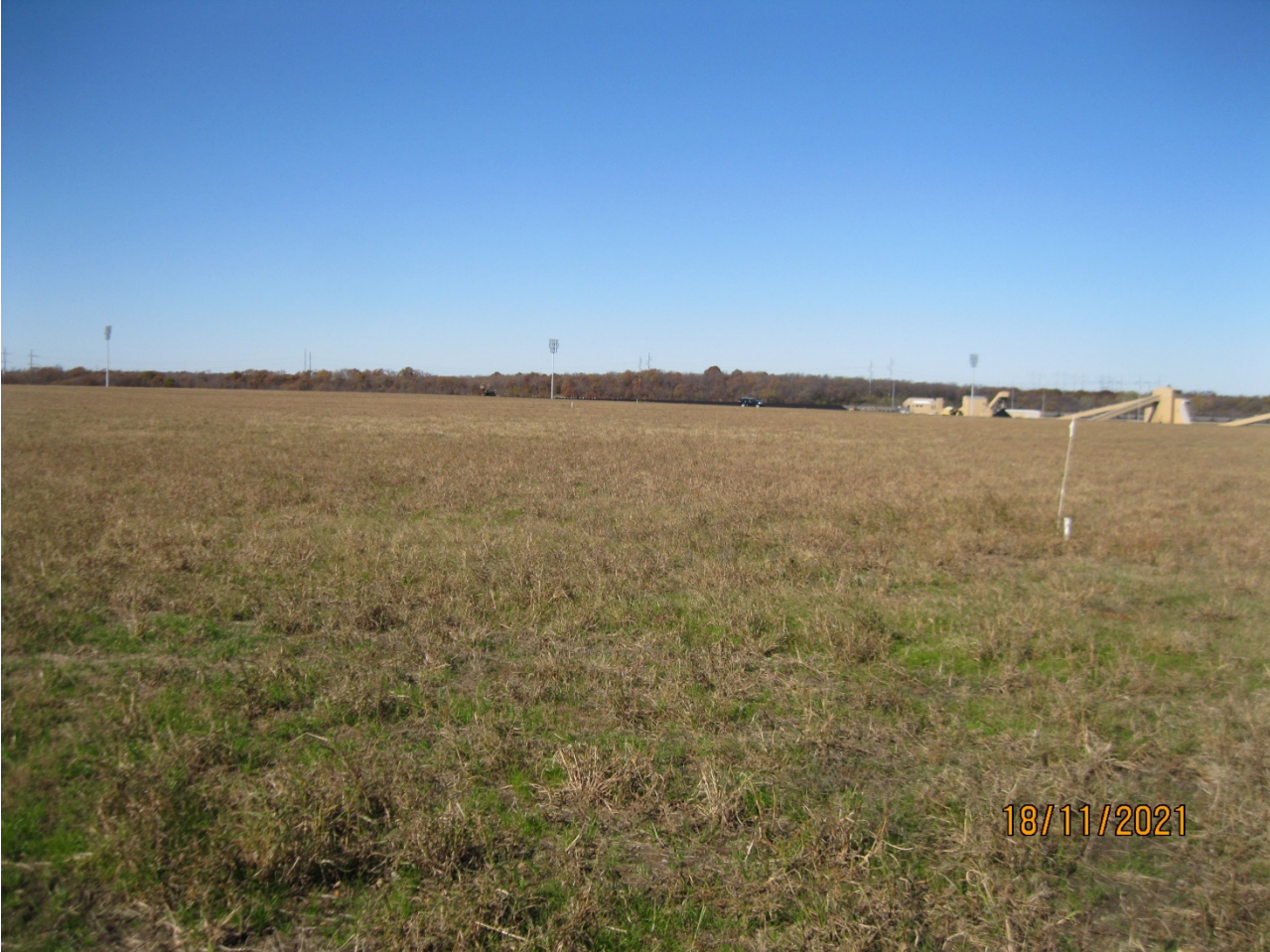
Figure 4-3 Final Cover on CCR Material – Top of Landfill looking North.