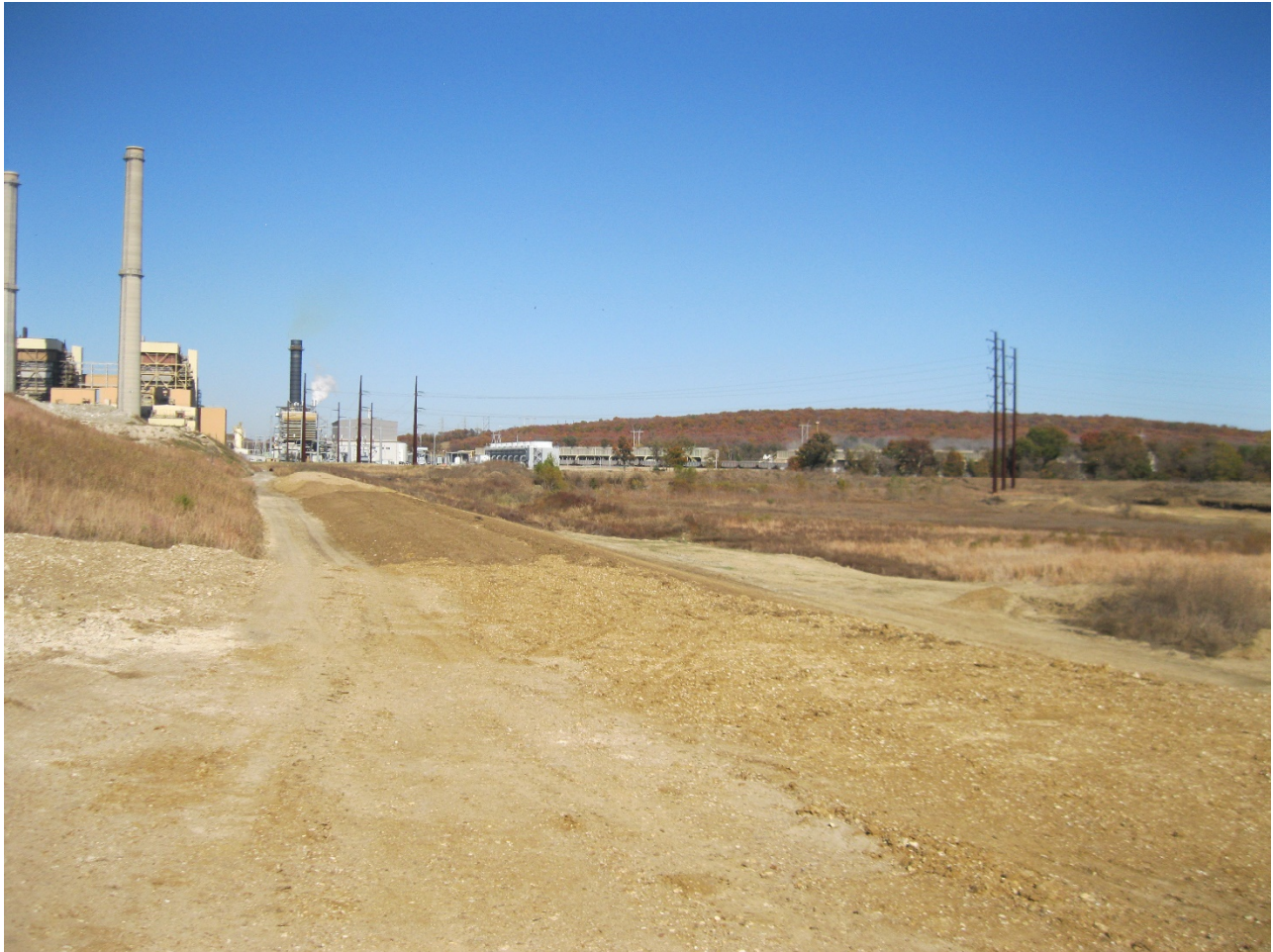
Figure 4-3 East CCR material with new embankment construction, South Looking North