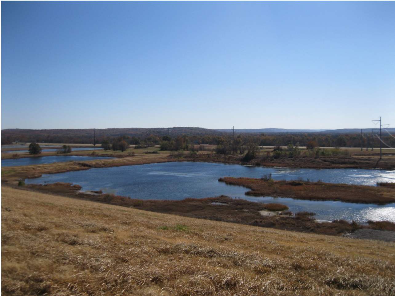
Figure 4-2 – South CCR Slope and Embankment with Vegetation Cover. Looking South.

access by the mowing equipment. No wet or damp areas were observed that would indicate seepage. The grass has prevented active erosion.