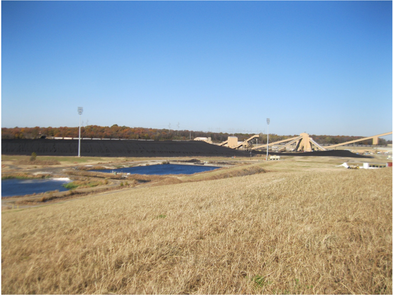
Figure 4-3 Final Cover on top of CCR Material – Top of Landfill from Center looking Northwest

The top surface of the landfill area has been graded to slope toward the north and the area has been covered with the planned cover soils, topsoil, and vegetation. The areas that had been vegetated within the past year were not discernable from older areas indicated good growth and appropriate mowing that limits brush and trees.