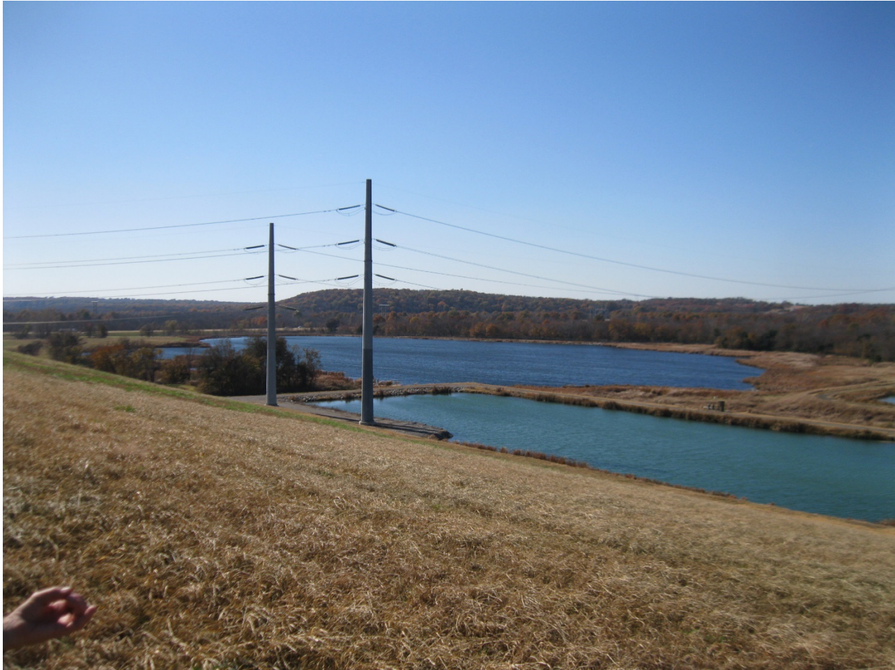
Figure 4-1 –Top of West Landfill, Center Looking South.

The crest of the embankment on the south side of the landfill had been covered with ash and the crest was not distinguishable along the side slope. The original permitted landfill embankments to the northeast, east, and southeast have been stripped of vegetation and used as cover soil on the final grades of the CCR material.