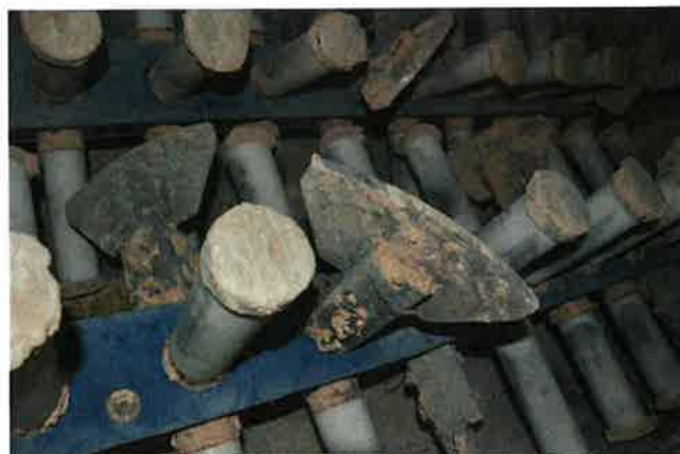
Figure 4.4 Interior of Pin & Paddle Mixer for Fugitive Dust Control (Preparation of Conditioned CCR)