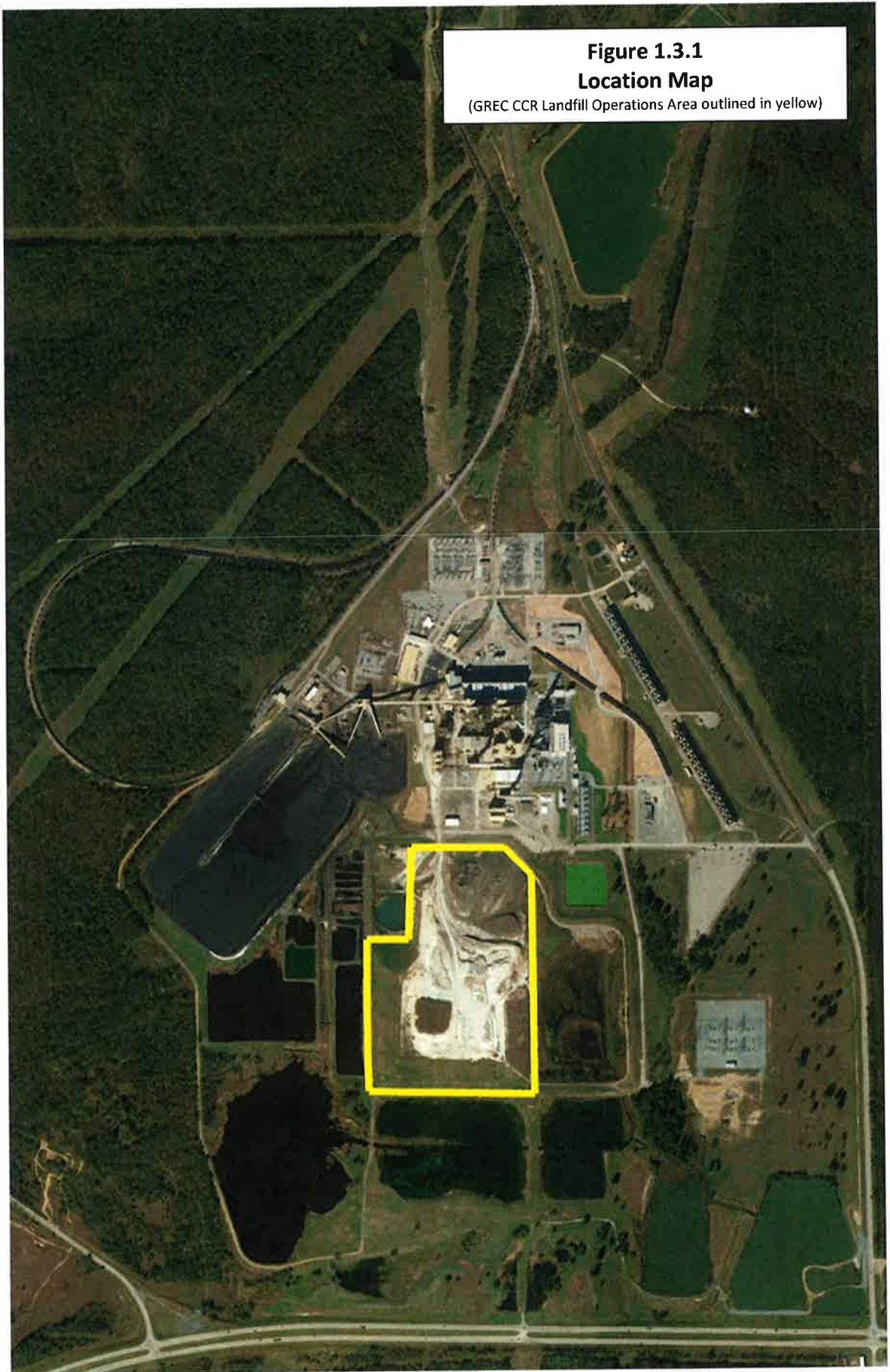
Figure 1.3.1 Location Map (GREC CCR Landfill Operations Area outlined in yellow)