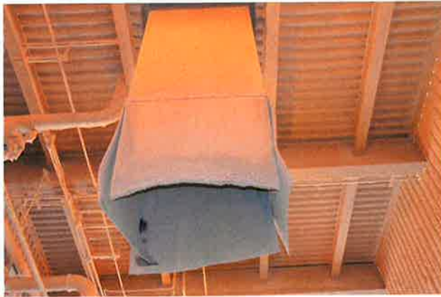
Figure 4.9 Truck Loading Spout for Pin & Paddle Mixer Discharge, extended for Fugitive Dust Control