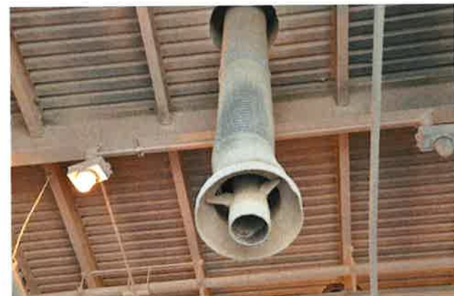
Figure 4.8 Typical Loading Spout in Truck Loading Bay at Ash Silos; Equipped with vacuum system and baghouse for Fugitive Dust Control