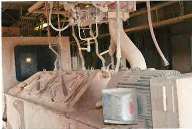
Figure 4.2 Pin & Paddle Mixer (Preparation of Conditioned CCR)