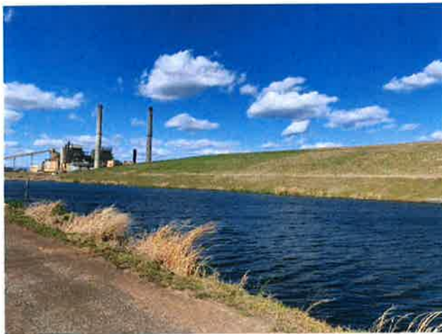
Figure 4.10 View of Vegetative Cover on West Sloped Side of Ash Landfill