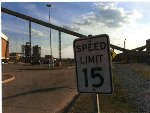
Figure 4.11 Example of posted 15 mph speed limit, with ash storage silos in background