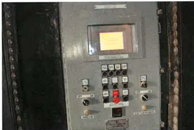
Figure 4.3 Control Panel for Pin & Paddle Mixer (Preparation of Conditioned CCR)