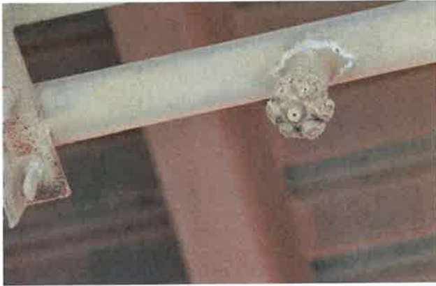
Figure 4.5 Spray Nozzle for Water Mist Curtain for Fugitive Dust Control at Ash Storage Silo Truck Loading Bay