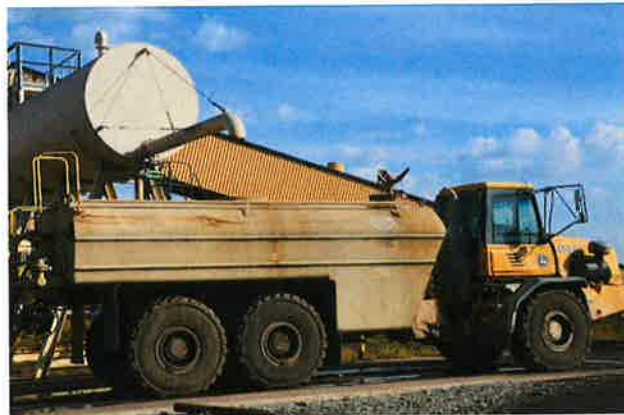
Figure 4.7 Typical Water Truck for Fugitive Dust Control John Deere Model 300D; 7,000 gallon capacity (or comparable)