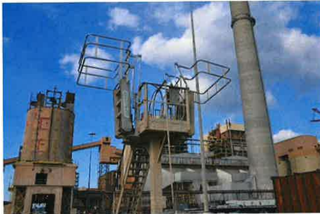
Figure 4.6 Truck Wash Station for Fugitive Dust Control