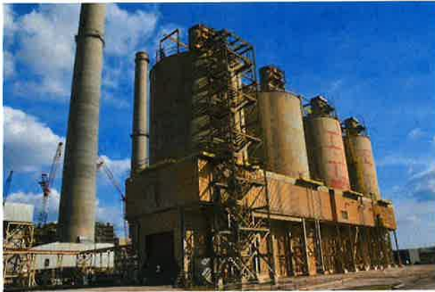
Figure 4.1 Ash Storage Silos with Partially Enclosed Truck Loading Bay