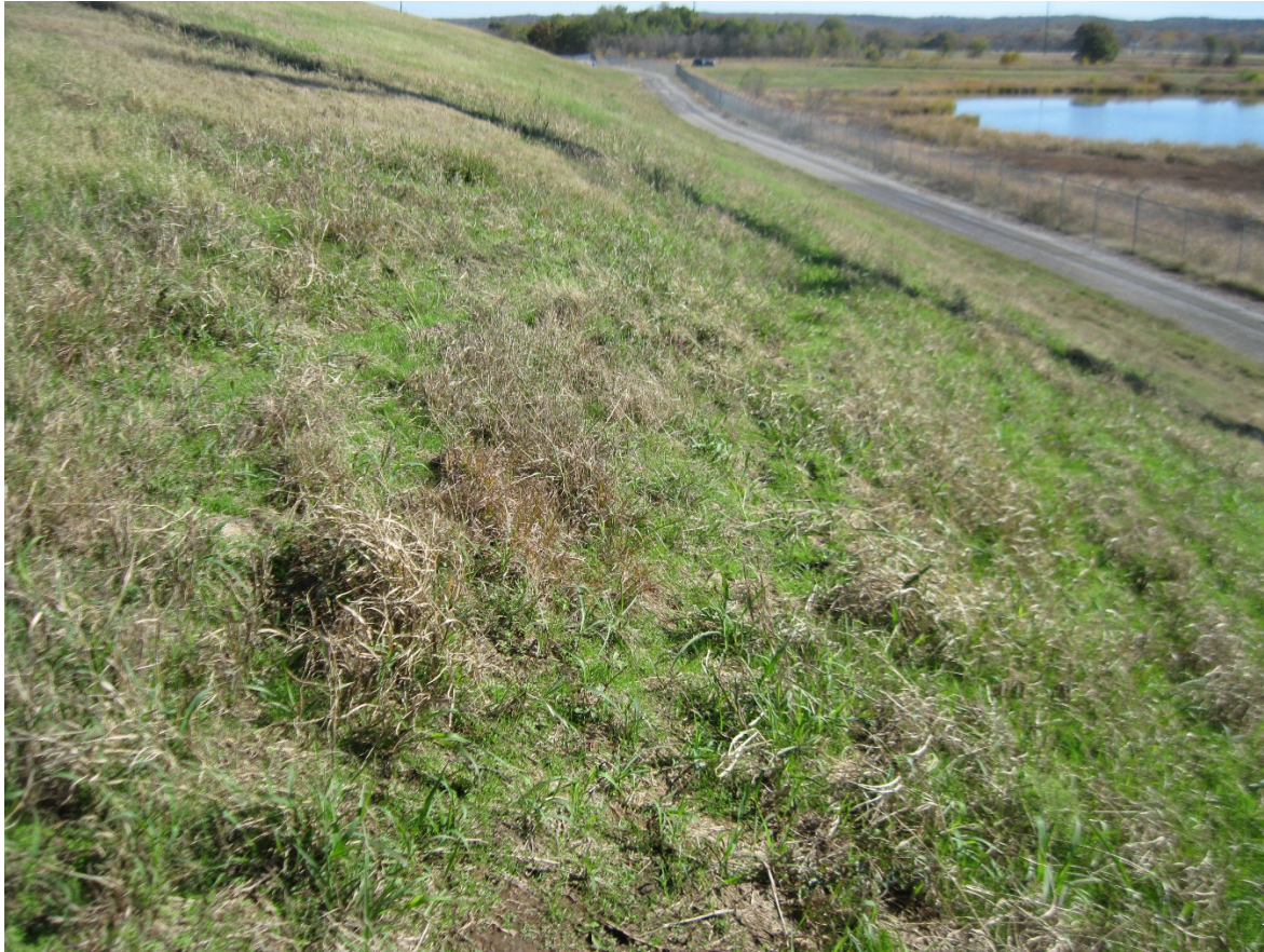
Figure 4-2 – South CCR Slope and Embankment with Vegetation Cover. Looking East.

There was no indication that some sod cover had more growth due to higher moisture contents. There was some signs of mowers sliding on the slope, but no loss of topsoil or rutting was observed. There was no indication of animal burrows or animal tracks leading to burrows.