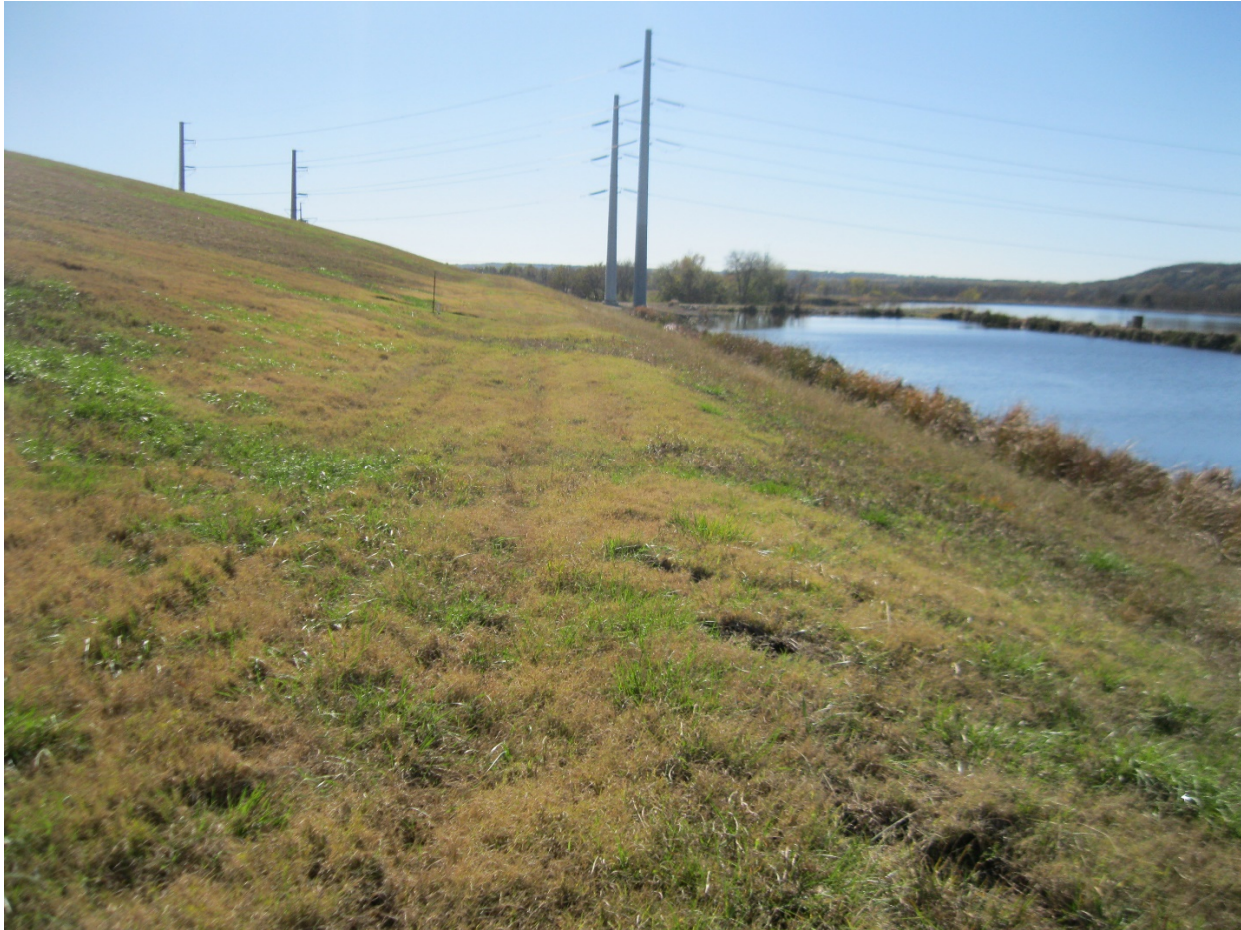
Figure 4-1 –Top of Crest – West Slope, looking south.

The crest of the embankment on the south side of the landfill had been covered with ash and the crest was not distinguishable along the side slope. The original permitted landfill embankments to the northeast, east, and southeast had been stripped of vegetation and used as cover soil on the final grades of the CCR material. Those embankments have vegetation growth.