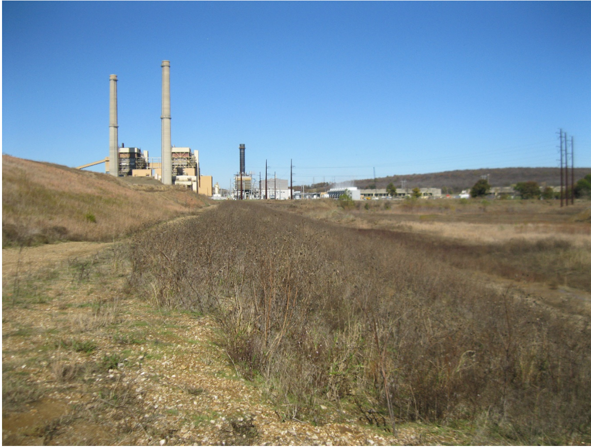
Figure 4-3 Top of CCR – East Slope, without final cover

The top surface of the landfill area has been graded to slope toward the north and the area has been covered with the planned cover soils, topsoil, and vegetation. The areas that had been vegetated within the past year were not discernable from older areas indicated good growth and appropriate mowing that limits brush and trees.