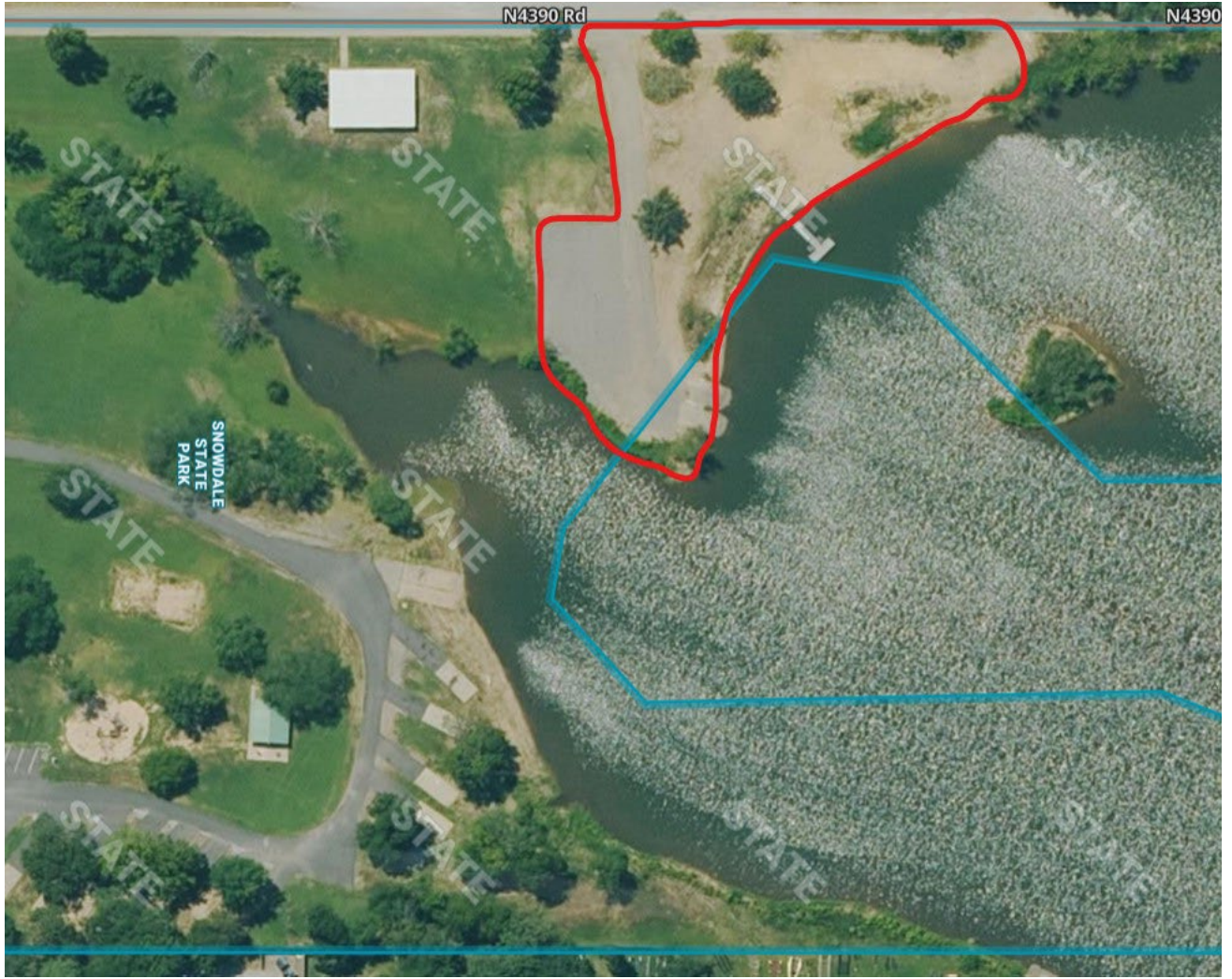
Snowdale State Park