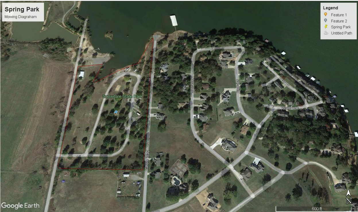
Snowdale State Park